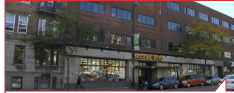
4388, Saint-Denis, Montréal