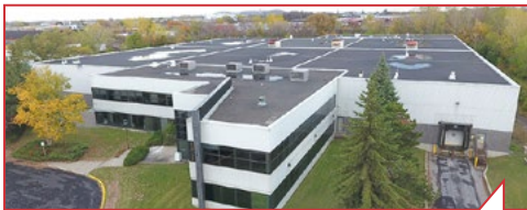
1100, 50 e Avenue, Lachine