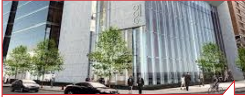
900, de Maisonneuve, Montréal