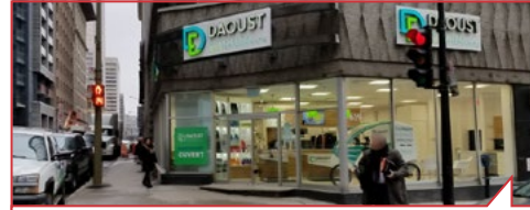
619, René-Levesque Ouest, Montréal