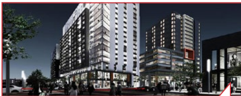
100, Peel, Montréal