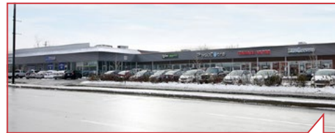
2908, Chemin Chamby, Longueuil